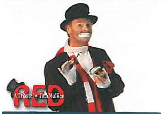
THE RED SKELTON TRIBUTE SHOW

Departure: Unity Baptist Church, 311 Smokey Rd, Newnan, GA @ 8 am