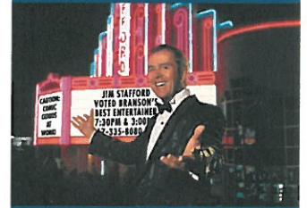
THE JIM STAFFORD SHOW