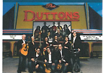
THE DUTTONS SHOW